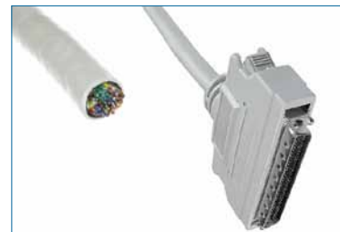
Punch Down Cable

IP/IPX over Frame Relay/ PPP/HDLC/X.25, X.25 over Frame Relay (Annex G), BSC over X.25, SNA over X.25, PPPoE, PPPoA, IP over ATM