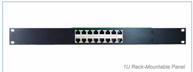
1U Rack-Mountable Panel